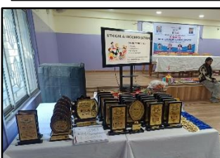
AWARDS & CERTIFICATES FOR RYLIANS