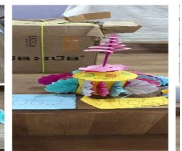
ART & CRAFT WORK