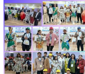
RYLIANS GOT TALENT FROM BEST OUT OF WASTE