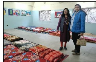
BEDDING ARRANGEMENT AT RYLA CAMP