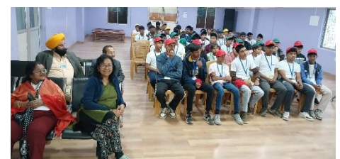
CLASS ROOM ACTIVITIES IN 3 DAYS SESSION