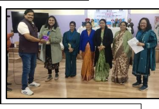
PRIZE DISTRIBUTION TO BEST CAMPER 1 ST , 2 ND 3 RD & 4 TH AND OTHER PARTICIPENTS ALSO AWARDED