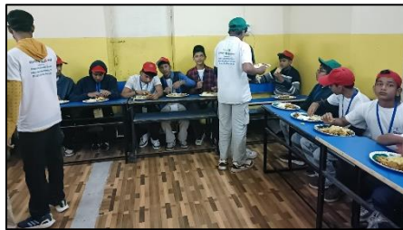
DINING HALL IN RYLA CAMP