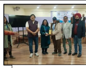
First Registrant & Juri of Talent Hunt ALSO AWARDED